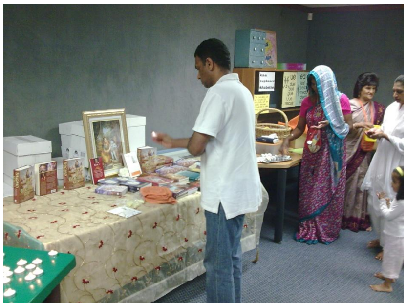
The service group members turning lamps and offering respects to Lord Damodara