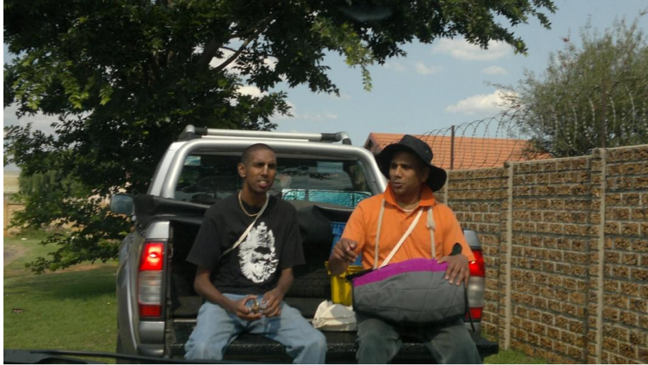
Harinam in Bakerton