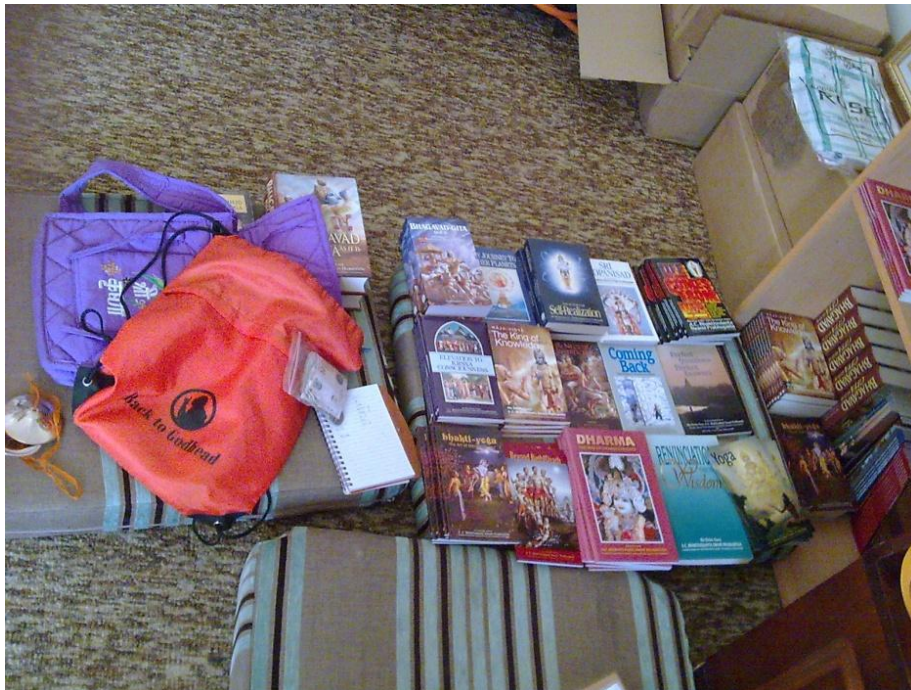
Books, books, books

We pray to always be engaged with this transcendental book distribution for Srila Prabhupada, in spreading Lord Krsna's glories, and to assist the devotees with their endeavours too.