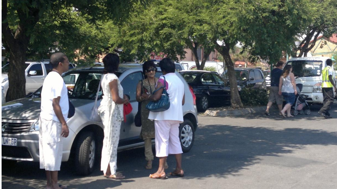
Devotees outside the Kara Glen shopping mall in Edenvale