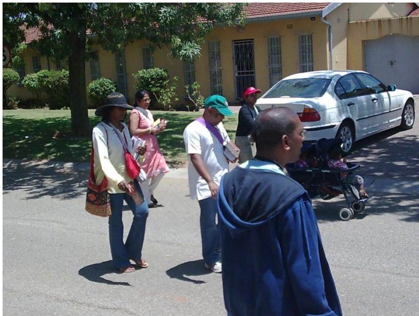
Devotees on the go in McKenzie Park

We also distributed flyers and books before the Ratha Yatra, in the McKenzie Park and Bakerton areas.